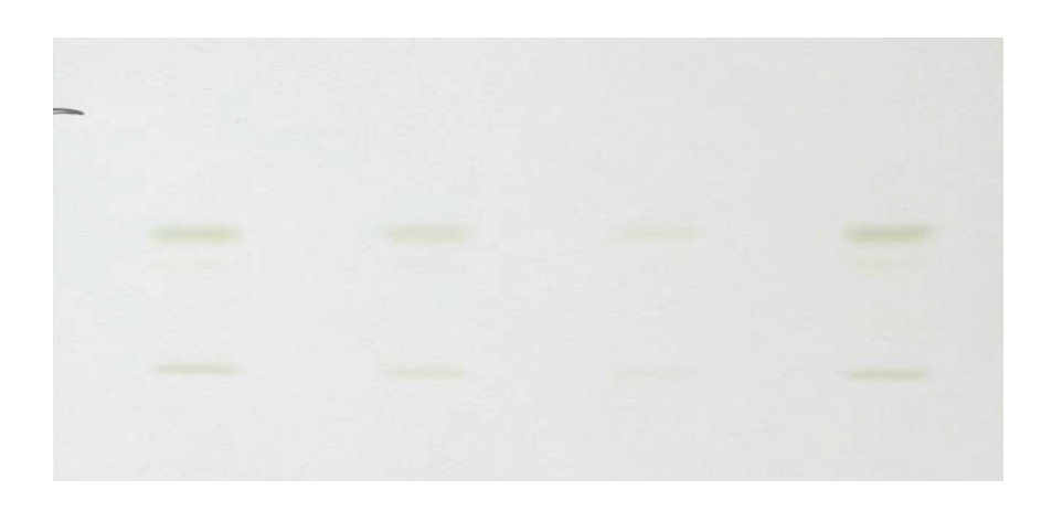
Fig.2 Determination of constitutes by High Performance Thin Layer Chromatograhy at 540nm (HPTLC)