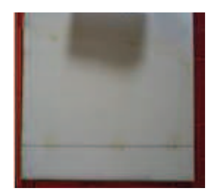
Fig.1 Determination of constitutes byThin Layer Chromatograhy (TLC)