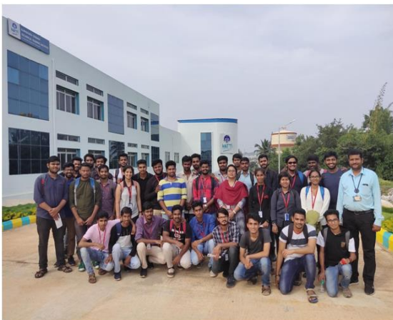
Group photo session at Karnataka German Technical Training Institute (KGMSDC)

The primary mission of KGMSDC is to provide broad based multi-disciplinary world class training programs in various technical fields, directed towards the development of specialized skills in alignment with the industry requirement across the globe.