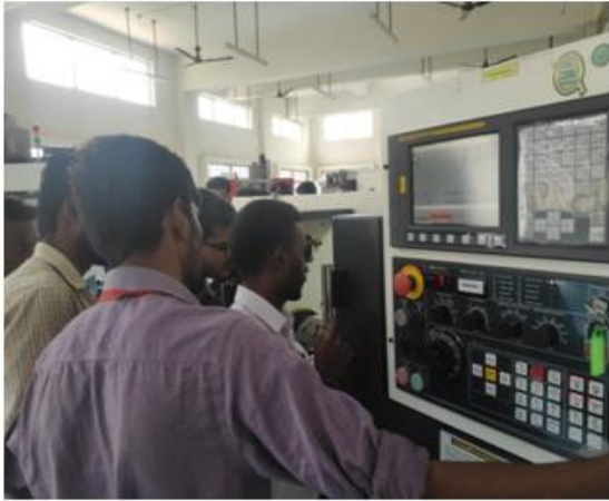
KGGTI staff explaining the use of CNC machine