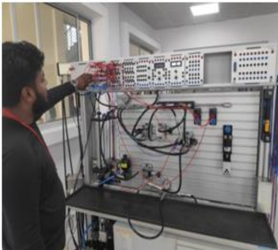
Hands on session for students to learn how to program and verify it with actuation system.

Acharya Institute of Technology- Dept. of Mechatronics Engineering, thank KGMSDC for learning experience.