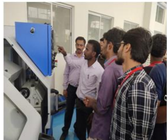
KGTTI staff explaining the use of CNC machine