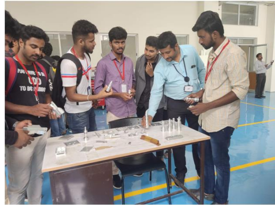
Students and faculty have seen the parts manufactured by industrial automation techniques.

To get exposure to modern technologies involving CNC Programming and operation, automation methods, PLC and SCADA in industry in what can be seen as a transition from theoretical knowledge imparted in classroom teaching to that applicable to industry.