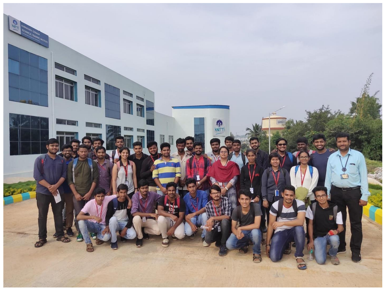
Group photo session at Karnataka German Technical Training Institute (KGMSDC)

The primary mission of KGMSDC is to provide broad based multi-disciplinary world class training programs in various technical fields, directed towards the development of specialized skills in alignment with the industry requirement across the globe.