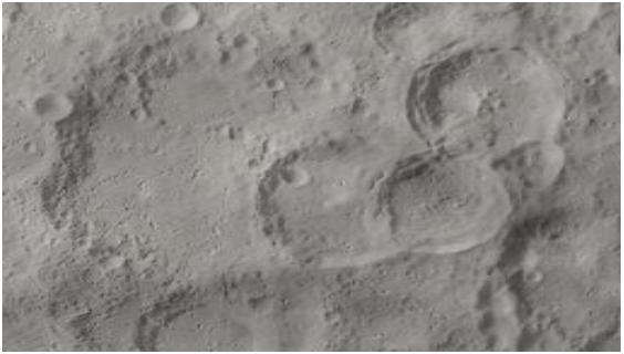
Fig 4(a): Input image