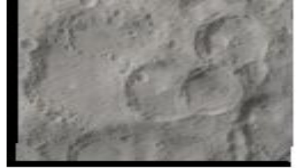
Fig 4(b): corresponding shifted image