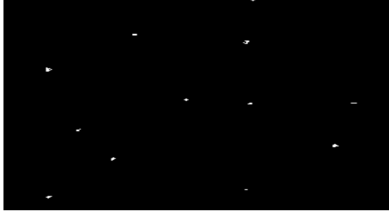
Fig 4(c): Result after feature extraction

Here a subsequent image is generated by giving shift x=5pixel, y=6pixel. Then feature extraction and matching is done using different matching techniques and results are shown in table below.