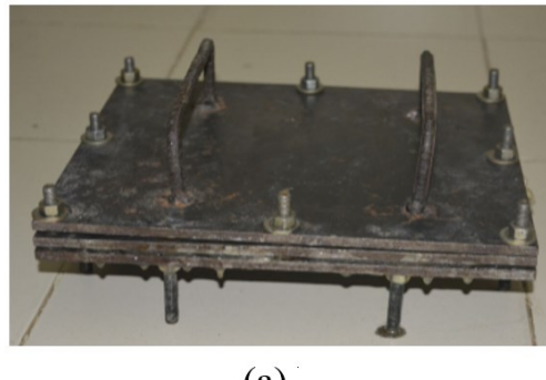
Figure 1. (a) Mold for sample preparation. (b) Prepared Samples after cutting