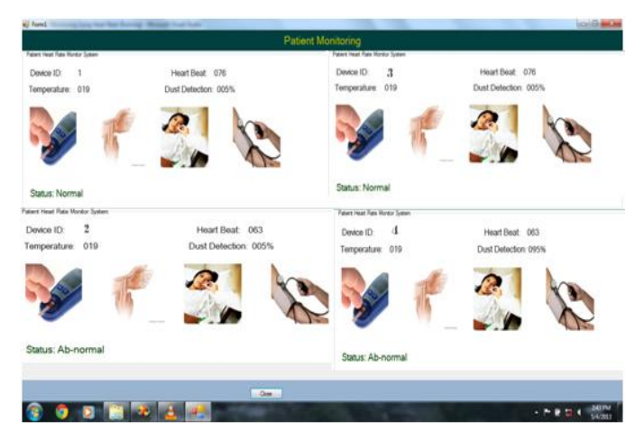
Figure 5: Reading from different patients

Here, a single microcontroller is used for a single patient. Similarly more number of microcontrollers can be used to obtain the results from multiple patients. Figure 5 demonstrates the reading from multiple patients.