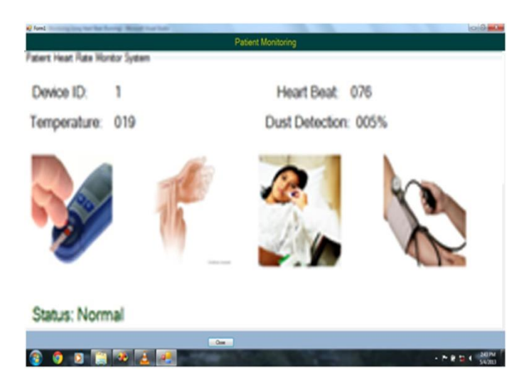
Figure 3: Normal Heart rate and temperature reading from patient 1

The reading from patient 1 is taken from the host computer and then wi-fied to the main computer. Figure 3 demonstrates the condition of the patient to be normal.