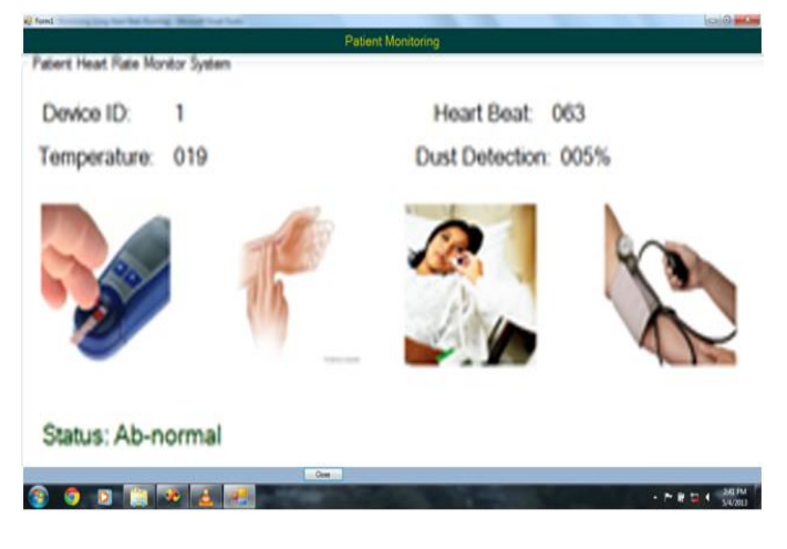
Figure 4: Abnormal Heart rate and temperature reading from patient 1

The reading from patient 1 is again taken from the host computer and then wi-fied to the main computer. Figure 4 below demonstrates the condition of the patient 1 to be abnormal. If there is any abnormal reading in the real time data from the sensors, an automatic message alert is sent to the mobile phone of the doctor or the health care professional.