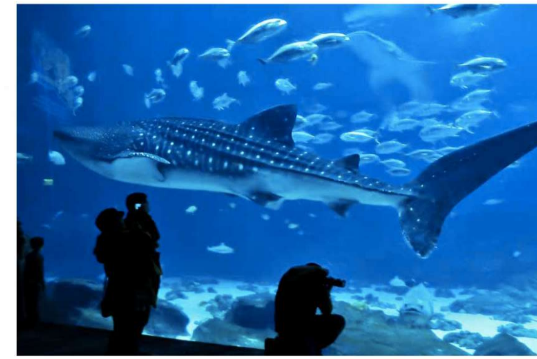
LARGE DISPLAY AQUARIUM