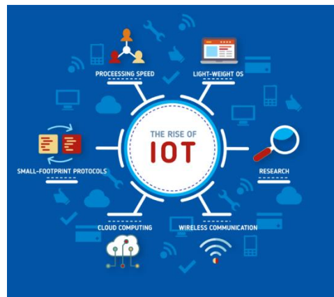
Figure 1. Concept of IoT

Now in China, there are nine billion devices that are expected to reach 24 billion by the year 2020. In future, the IoT will completely change our living styles and business models. It will permit people and devices to communicate anytime, anyplace, with any device under ideal conditions using any network and any service [4]. The main goal of IoT is to create Superior world for human beings in the future. Fig. 1 shows the concept of IoT with their capabilities.