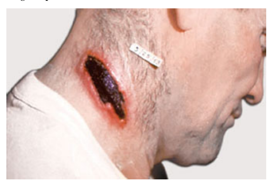
Fig. 13.3. Malignant pustule.