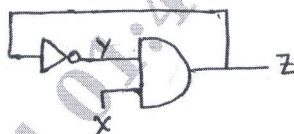
Fig. Q8 (a)