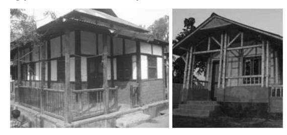
Fig.3: The vernacular architecture and its imitation in concrete

Also, several resorts and guest houses have been constructed which seem like a dire imitation of the rural vernacular architecture of the settlement. Influence of foreign cultures has also brought about changes in the traditional methods of construction. Ikra houses with sloping roofs have been replaced by concrete and glass flat roofed houses which are wrongly considered to be a symbol of status.