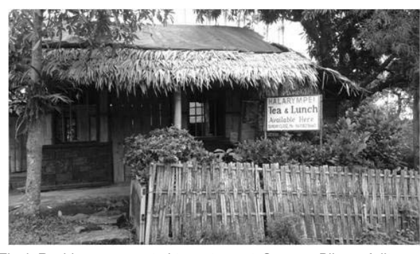
Fig.4: Residence converted to restaurant, Source: Bikram Aditya Nath

Due to the inflow of a large number of tourists to this settlement, most of the residences have converted the whole or at least part of their house to a restaurant or guesthouse.