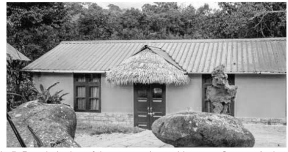
Fig.5: Poor imitation of the vernacular architecture, Source: Author

Poor emulation of the vernacular architecture is seen throughout the settlement. Some vernacular houses which were not able to take the pressure of overcrowding were quickly replaced with construction materials like G.I sheets, PVC pipes and concrete which does not require very frequent maintenance. As a result, the vernacular character of the settlement is drastically changing. There have also been several instances of overcrowding of the church premises which may in near future brew issues of vandalism and thus cause damage to the heritage structure.